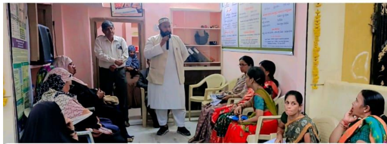
Hindu- Muslim - Christian Faith Leaders offerings Multi Faith Prayers at Inauguration of COVA Community Centre in Hyderabad, India

COVA Community Center was inaugurated at Kurmaguda, Hyderabad on 26th May 2024 to secure entitlements and enable empowerment of people in four localities of Kurmaguda Ward and to foster harmony and peace between communities of the area.